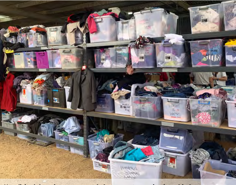
Unsolicited donations can overwhelm support organisations, hinder recovery, and end up in landfill.

GIVIT is the smart way to direct public generosity to ensure vulnerable people get what they need, when they need it.