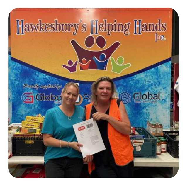
Coles vouchers being delivered to Hawkesbury's Helping Hands.

Tweed-based Momentum Collective assists those in need from both sides of the border. People already experiencing domestic and family violence, homelessness, mental ill-health or disability have been impacted by these floods. GIVIT provided grocery and fuel vouchers for Momentum Collective case workers to distribute to vulnerable flood-affected members of the community.