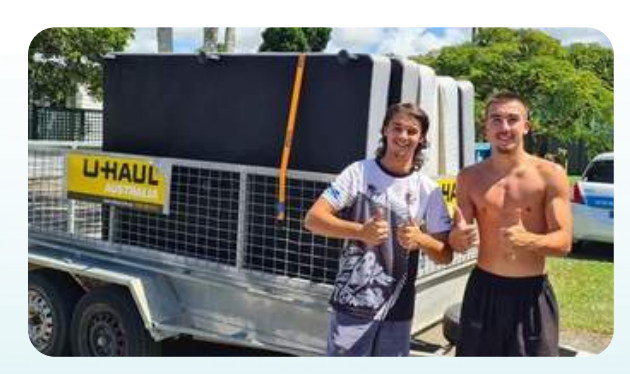
Beds and mattresses being delivered to flood-impacted people in the Tweed.

Through GIVIT, a Gold Coast hotel donated 14 queen beds and mattresses to First Nations organisation Currie Country Social Change Aboriginal Corporation. These beds and mattresses were given to locals whose homes had been flooded in Fingal Head, Chinderah, Kingscliff and the Tweed.