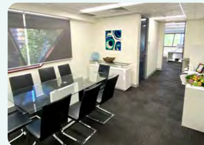
Pre-loved furniture donations provided through GIVIT fit out the Fearless Women office.

This year, GIVIT re-homed almost 200,000 quality goods nationally that were donated through our online warehouse including household furniture, whitegoods and baby essentials.