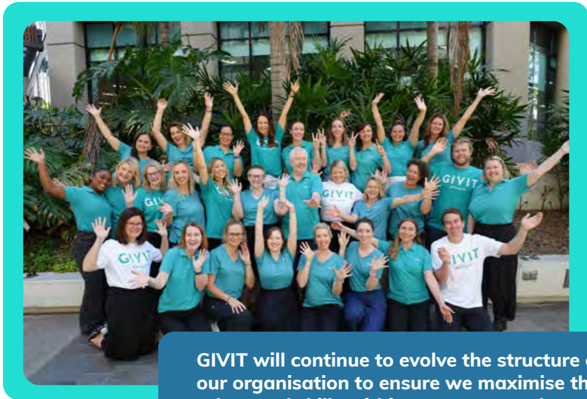
The dedicated GIVIT team reflecting and celebrating a year of incredible impact at our annual conference.

The Fundraising Team seeks out and collaborates with a wide range of individuals, workplaces and passionate supporters who wish to contribute to GIVIT's impact in the community through hosting or participating in fundraising events, donating funds, goods or services.