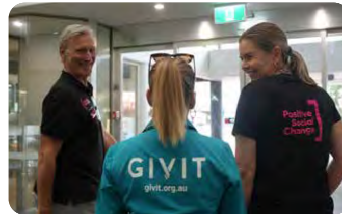
GIVIT meeting with the team from Social Futures in Lismore to discuss flood recovery.

The 2019/2020 Black Summer Bushfires represented one of the most significant natural disasters in Australia's history. More than four years later, GIVIT continues to work with impacted communities who remain displaced by this disaster. In the past twelve months, GIVIT has purchased furniture and whitegoods for families in East Gippsland who are finally returning to rebuilt homes. We are also working with charity partners in the ACT and New South Wales to continue meeting the needs of disaster impacted communities in these regions. Similarly, GIVIT is still active in Northern New South Wales following floods in 2022 and the Kimberley region of Western Australia following flooding in early 2023, with many people in these communities still displaced and living in temporary accommodation.