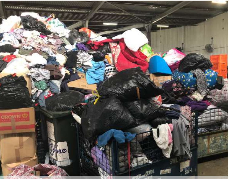
Unsolicited donations can overwhelm support organisations, hinder recovery, and end up in landfill, like they did after flooding in Townsville in 2019.

GIVIT is the smart way to direct public generosity to ensure vulnerable people get what they need, when they need it.